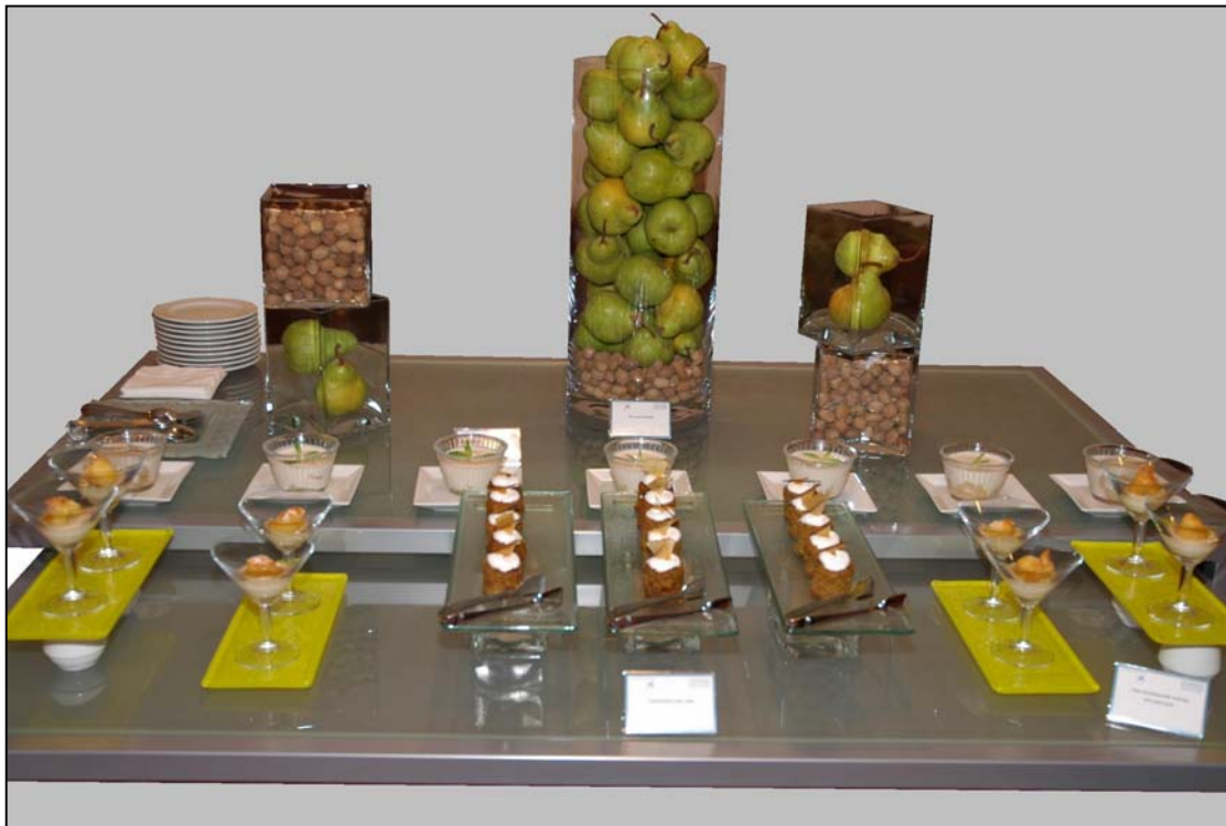
Caramelised pear cake, pear dumpling with nutmeg and pear juice, yoghurt with pear, nutmeg compote and honey.