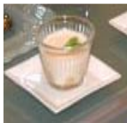
Yoghurt with pear, nutmeg compote and honey (glass ramekin)